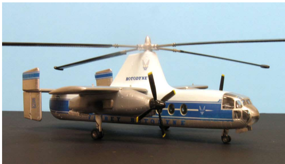
Tony D'Anjou's 1/72 Fairey Rotodyne, built OOB and painted with Model Master enamels plus SnJ metallic powder. Decals are from the kit.