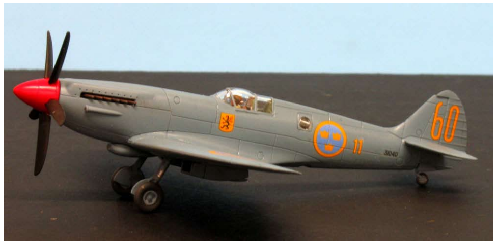
Bill Michaels' 1/72 scale Spitfire PR Mk.XIX, built OOB and painted with Polly Scale acrylics. Kit markings are for the Swedish AF in 1947.