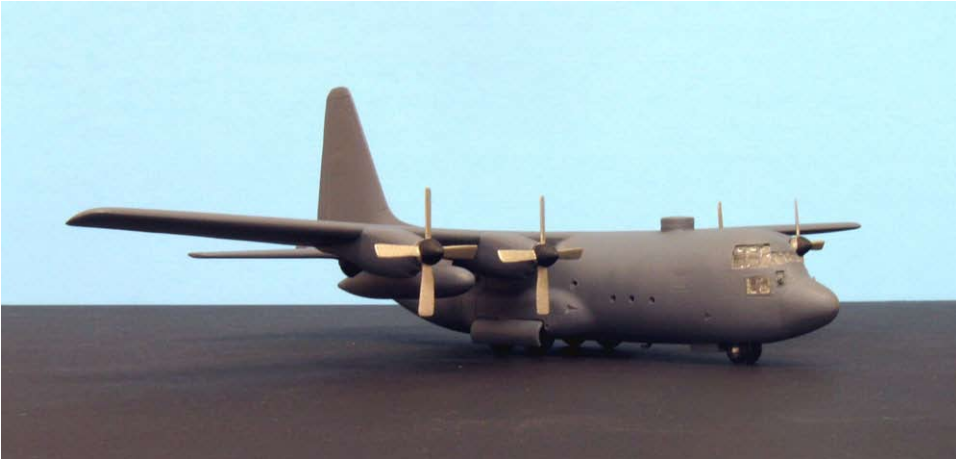
Rick Lippincott's 1/144 scale C-130E, built mostly OOB and painted with Model Master enamels. The decals, still to be applied, will be for Iraqi Air Force Transport Squadron 1 as it appeared in 2009.