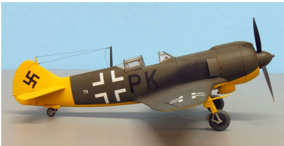
Pip Moss's 1/48 scale La-5FN, built OOB and painted with Floquil Military Colors. AML decals were used for a captured plane flown by the Zirkus Rosarius (see the caption for Tony D'Anjou's P-47 on Page 3).