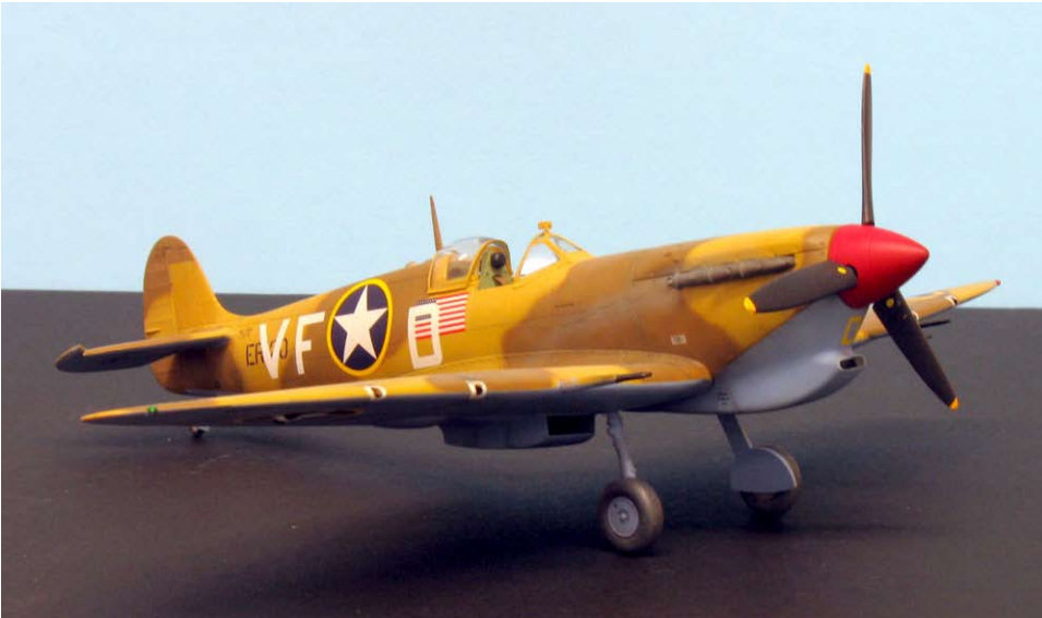
Pip Moss's 1/48 scale Spitfire Mk. Vb trop. in American markings. Added items include PE seat belts and Ultracast resin elevators. The model was painted with Floquil Military Colors and Aeromaster enamels with different shades for the overpainted roundels and fin flashes. Decals, from Third Group, are for a plane from the 5th AF, 52nd FG, as it appeared prior to being shot down over Tunisia early in 1943