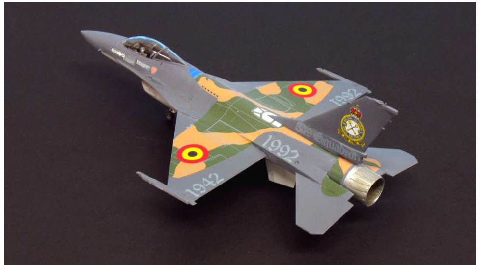
Bill Michaels' 1/72 F-16A, built OOB and painted with Model Master acrylics. The decals, from the Revell AG kit, are for the Belgian Air Force's 349th Squadron in its special 50th anniversary Spitfire scheme.