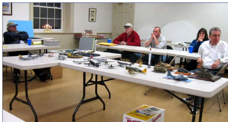
With over twenty models on the table, representing the work of no less than eleven members, this was certainly a Show-and-Tell to remember!