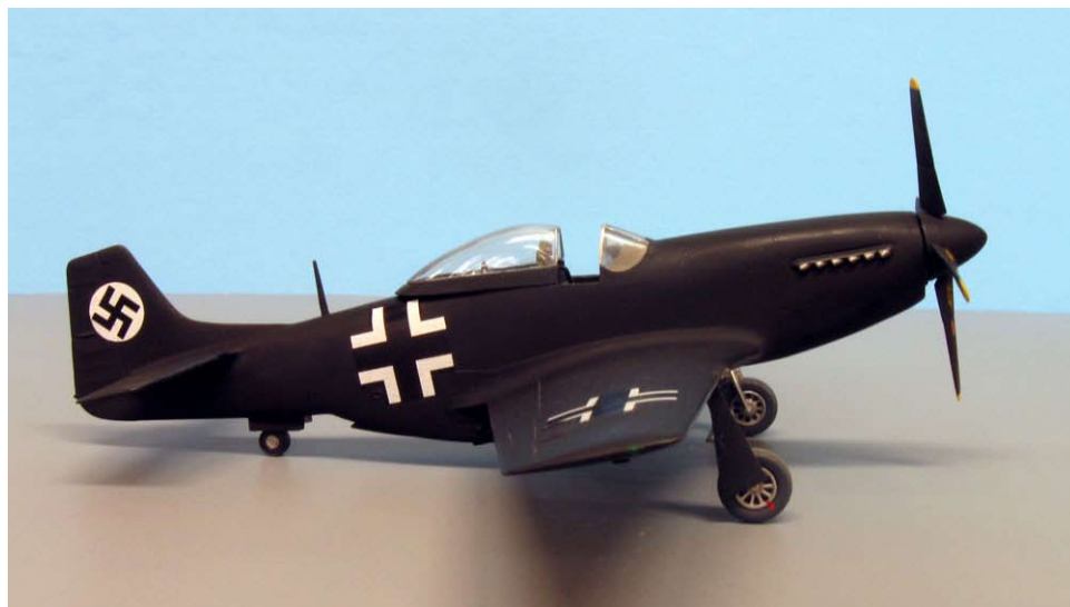
Jim Qualey's 1/48 P-51D, Luftwaffe style.