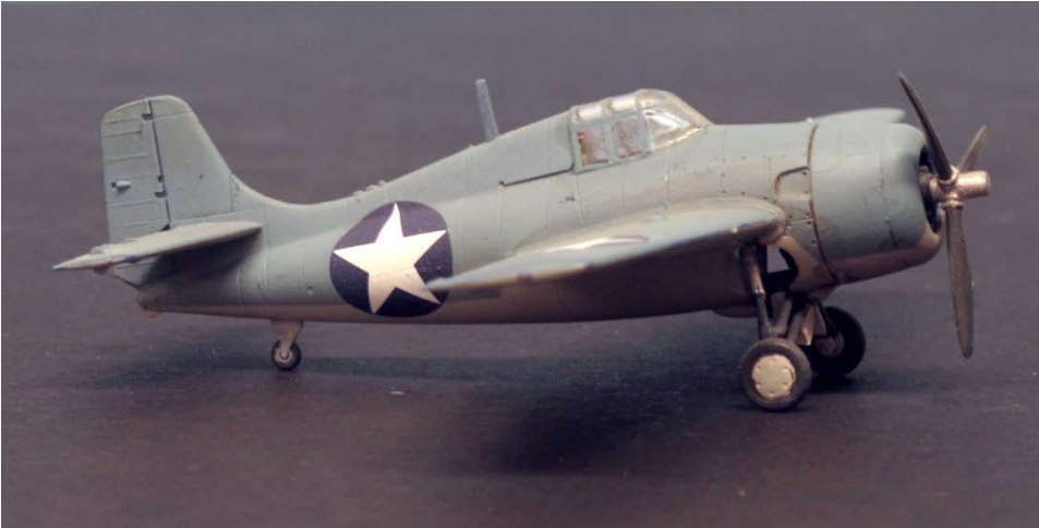
Two views of Bill Michaels' 1/144 scale Grumman F4F-4 Wildcat, which he converted from an FM-2 kit by reshaping the rudder and using a different radio mast. Paint is Polly Scale acrylics. Decals, from the scrap box, are for a USMC plane on Guadalcanal in 1942.