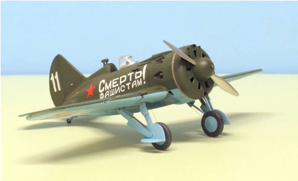
Two views of Pip Moss's 1/48 scale Polikarpov I-16 Type 24 in markings of a plane seen in propaganda photos with Russian ace Boris Safonov of 72 SAP, Murmansk, 1942. The model was built OOB, but with the addition of photo-etch seatbelts and nylon monofilament for the landing gear retraction cables. Lower surface All Blue is a mix of Model Master and Mr. Color; Upper surface All Green is Mr. Color Russian Green No. 2. Decals are from the kit. Port slogan reads, "FOR STALIN!" Starboard slogan reads, "DEATH TO FASCISM!"