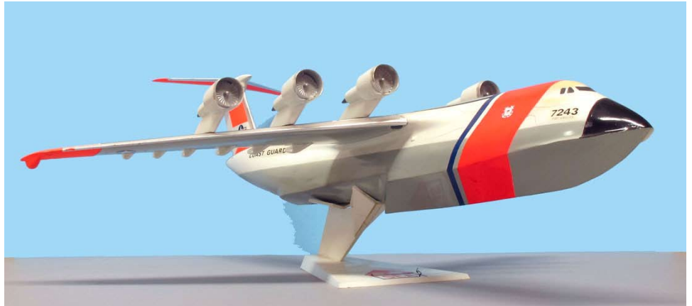
Another view of Tony D'Anjou's 1/144 scale C-5 seaplane Galaxy.