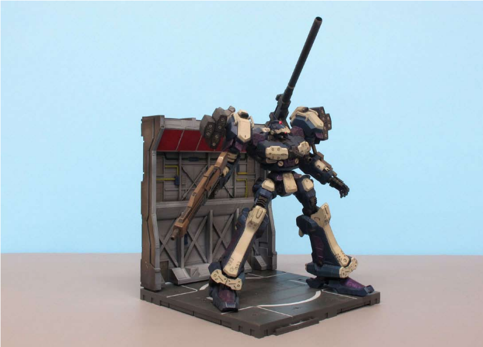
George Caswell's 1/72 scale armed Zaku as seen in the video game "Armored Core."

Pip Moss's 1/350 scale Klingon Bird of Prey, built OOB, painted with Model Master enamels and Alclad metallic lacquers, and weathered with oil washes, Rustall and drybrushing of acrylic Rust paint. Pip adds, "I wasn't really looking forward to this build, but it turned out to be quite fun and gave me a chance to do a lot of brushpainting."