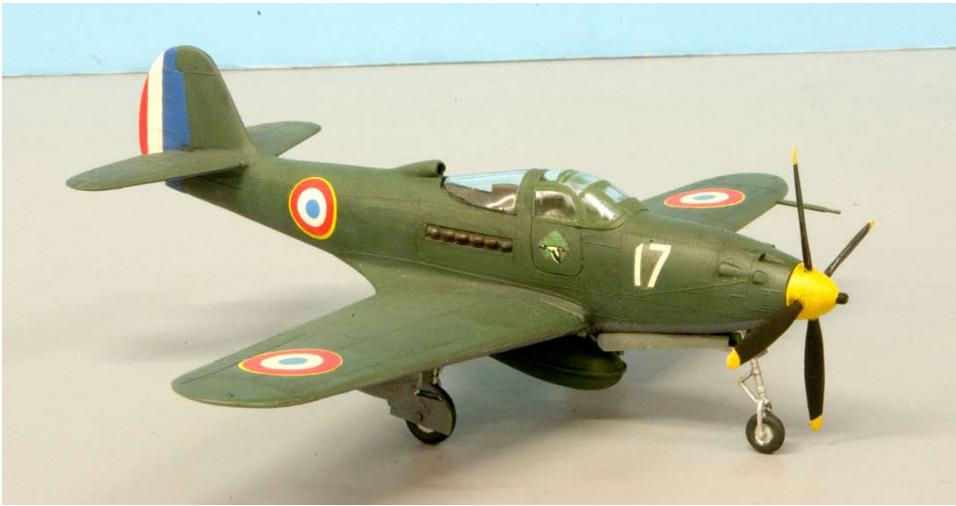
Steve Cardoos's 1/72 scale P-39