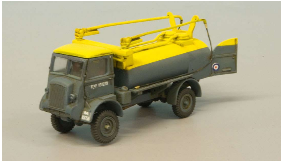
Two views of Steve Cardoos's 1/72 scale Bedford QL Fuel Bowser truck