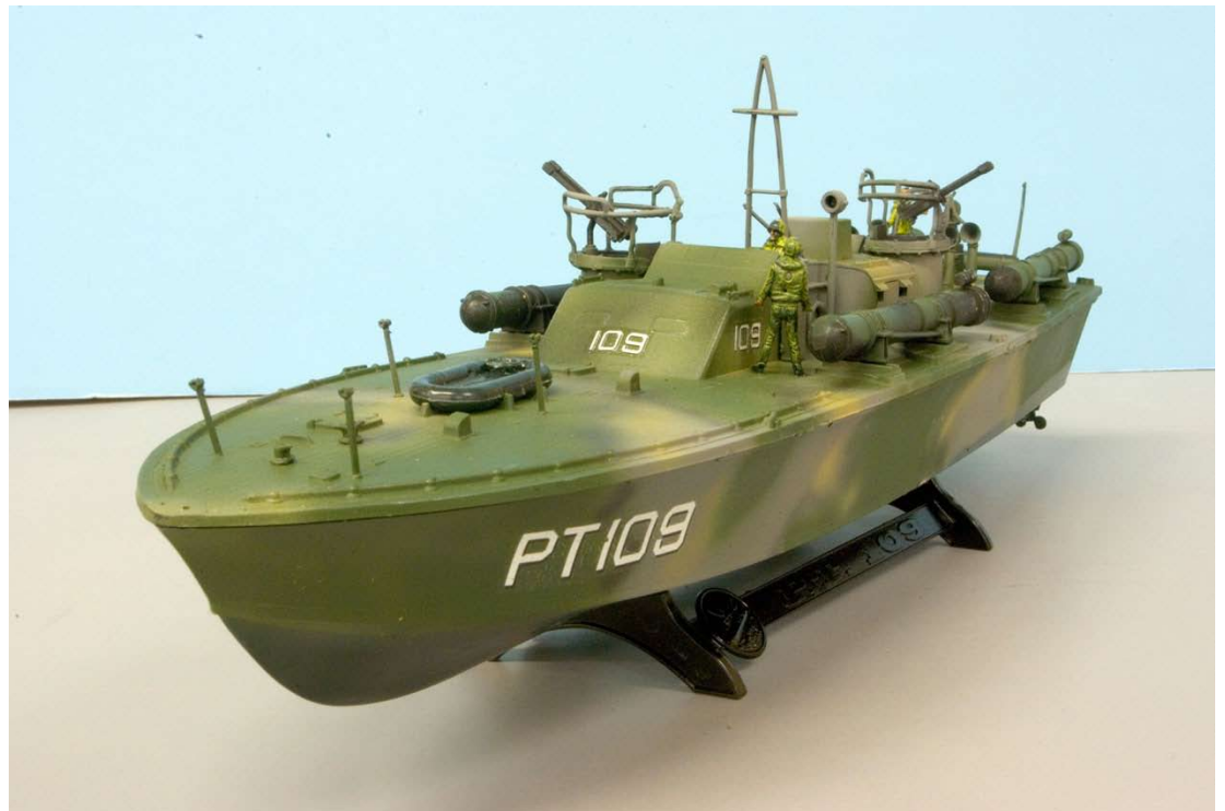
Once again we feature a build of Revell's old 1/72 PT-109. This time it's by Bart Navarro and features figures and a neat camouflage scheme. Nice job! (See Page 5 for another view.)

The next Patriot Chapter meeting will take place on Friday, February 1, at 7:30 p.m. at the First Parish Unitarian Church in Billerica, MA. The church is located on Concord Road, just as it meets Route 3A (Boston Road) at the Billerica Town Common. The February meeting will be a build session with a business meeting, Show- and-Tell, and a raffle.