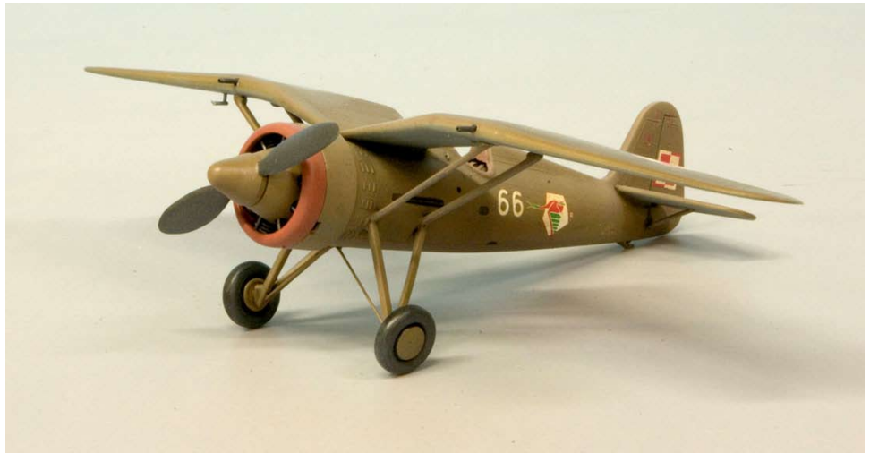
Steve Cardoos's 1/72 scale PZL P-11c