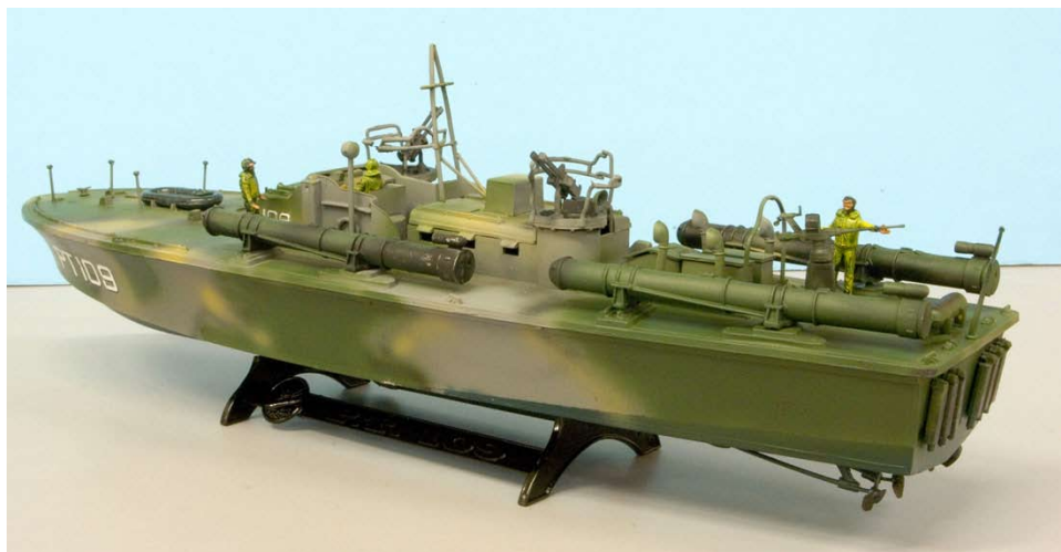
Another view of Bart Navarro's 1/72 PT-109