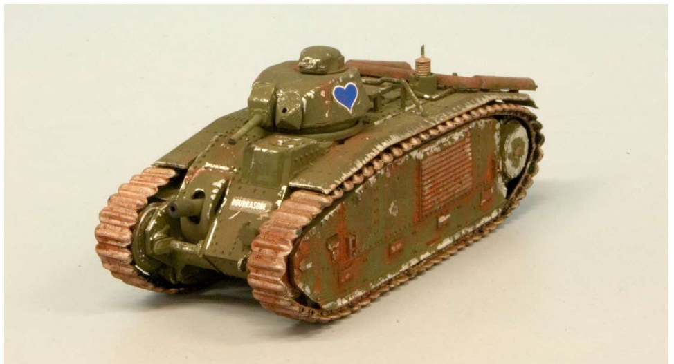
Two views of Matt Fleuy's 1/72 Char B-1 bis