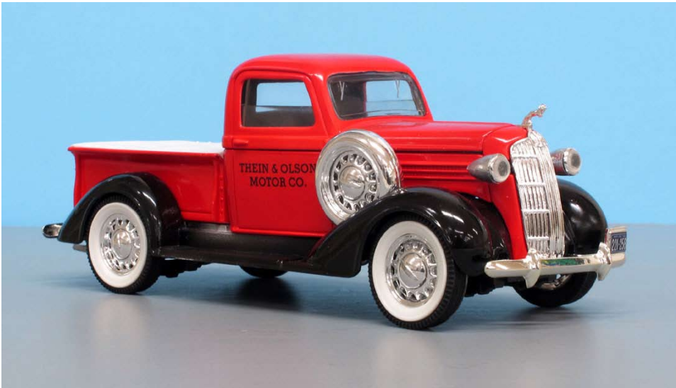
Two more views of Tony D'Anjou's 1/24 scale 1936 Dodge pickup truck.