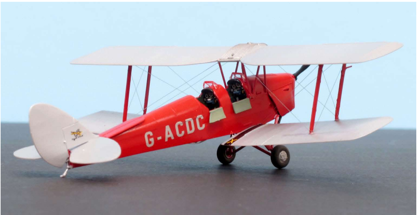
Bill Michaels did this lovely build of the recently released and very nice Airfix 1/72 Tiger Moth. Bill added aftermarket seat belts and painted the model with Tamiya acrylics. He used the kit decals for G-ACDC, the oldest Tiger Moth still flying today.

The next Patriot Chapter meeting will take place on Friday, September 5, at 7:30 p.m. at the First Parish Unitarian Church in Billerica, MA. The church is located on Concord Road, just as it meets Route 3A (Boston Road) at the Billerica Town Common. The September meeting will be a build session with a business meeting, Show-and-Tell, and a raffle.