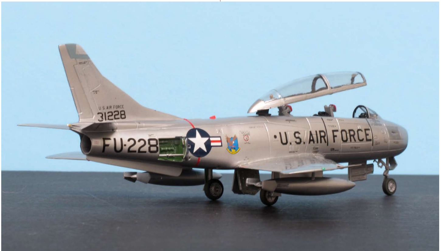
Another view of Ken Myers' TF-86F