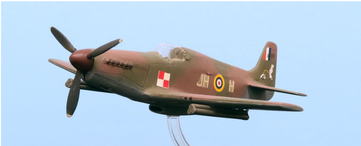
Frank Moore's 1:48 scale Mustang III. Frank converted it from an Aurora P-51D by adding the raised rear fuselage spine and replacing the bubble canopy with a British-developed Malcolm canopy. Paints are Tamiya acrylics. Markings are fictitious.