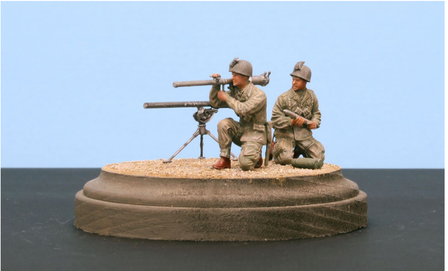
Frank Moore's 1:35 scale recoilless rifle (bazooka) and crew, and tripod-mount 50-cal. machine gun, all from Tamiya.