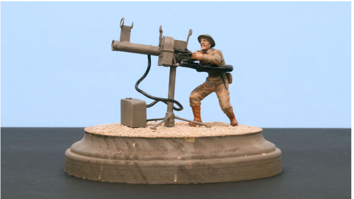
Frank Moore's 1:35 scale 50-cal. machine gun (Tamiya). Frank converted it to water-cooled configuration. Paints are Tamiya.