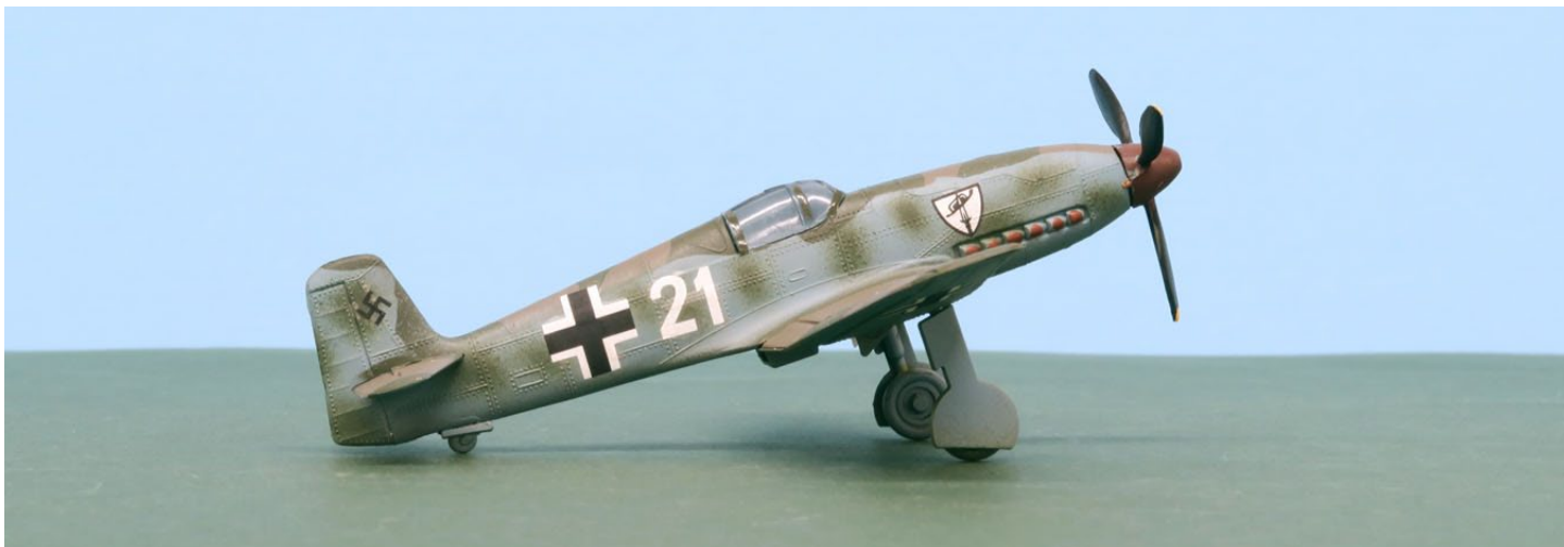
Frank Moore's 1:72-ish scale Heinkel He 100 D (Lindberg), built OOB and painted with Tamiya acrylics. Decals are from the kit. Although the He 100 was one of the fastest (it briefly held the world speed record of 463 mph in 1939) and most advanced fighters of its time, the type was not ordered into production by the RLM for reasons that remain obscure to this day.