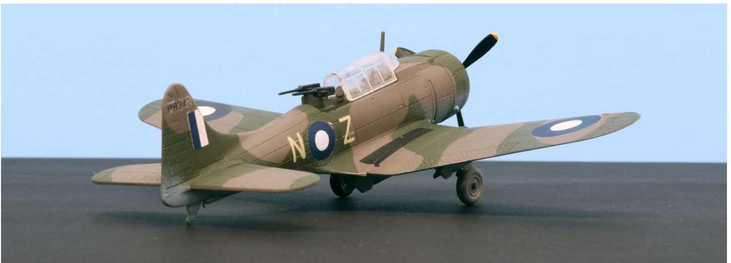
Frank Moore's 1:72 scale SBD-4 Dauntless (Hawk), built OOB and painted with Tamiya acrylics. Markings, from Aeroscale, are for the Royal New Zealand Air Force, which received 41 SBD-4s and -5s and used them successfully in combat over the Pacific.